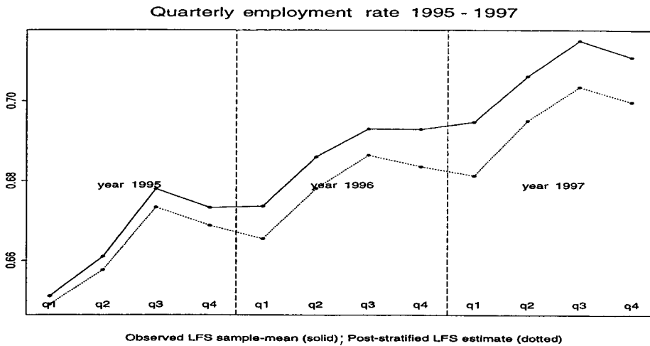
Fig. 4. LFS-employment rate in the Norwegian LFS from 1995 to 1997

At present the sample of families is selected from the Central Address Register (CAR), which is essentially a register of families. The main reason for this is the costs associated with interview. However, it is possible to select individuals from the Central Population Register (CPR) and link them to the CAR to obtain more accurate addresses. Moreover, the CPR also contains information about sex and age of each individual, and therefore the "structure" of the family. A question of interest is whether this information can be used to form homogeneous strata. It is well known that young and old people change status on the labour market more often than the rest of the population. It is therefore natural to study the feasibility of stratifying the families before selection and overrepresenting families with young and old individuals.