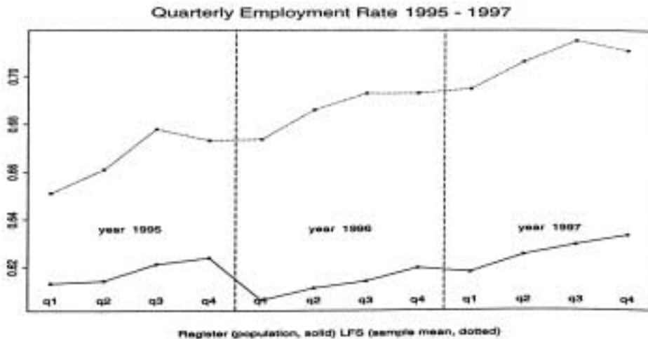
Fig. 1. Register-Employment and LFS-Employment in Norway from 1995 to 1997

Rates, and the dotted ones the quarterly sample LFS-Employment Rates. There are many reasons why the LFS is necessary in spite of the existence of the Employment Registers, several of which can be seen in Figure 1. First of all there is a clear discrepancy in the overall levels according to the two sources. This is largely due to the definition of the Register-Employment, which is different from the ILO-definition commonly used in the LFS Statistics. At the end of each calendar year, the Register undergoes a major control which produces unpredictable outcomes. Throughout the year, the Employment Register is updated based on reports from employers. Delay in the process is probably a reason why the Register-Employment Rate is higher in the 4th than the 3rd quarter, which counters the traditional wisdom of economy. At present, we are not able to determine the general pattern of the variations, including such delays, in this self-governed reporting process.